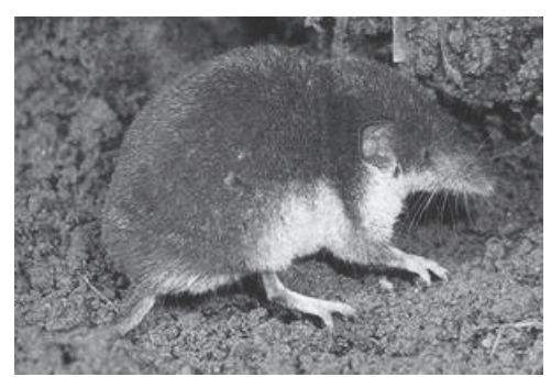
Ansell's Shrew Crocidura ansellorum Red list status: Endangered