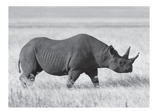
Black Rhinoceros Diceros bicornis Red list status: Critically endangered