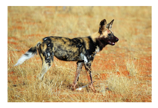
African Wild Dog Lycaon pictus Red list status: Endangered