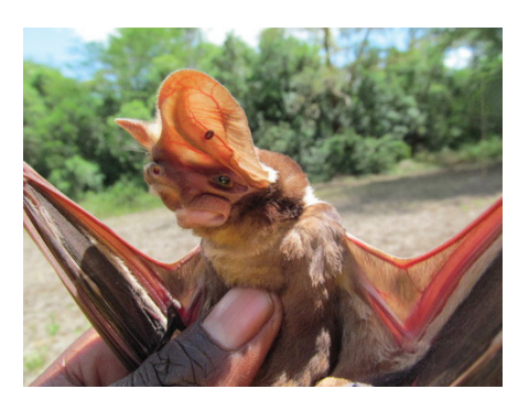
Large-eared free-tailed Bat Otomops martiensseni Red list status: Near threatened