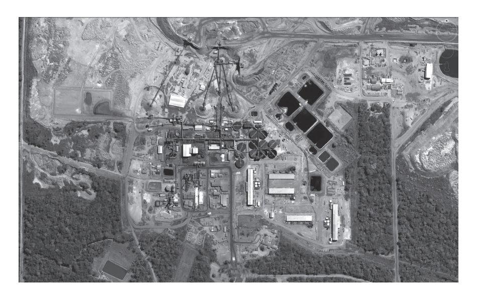
Figure 5(a): Kansanshi mine in the Northwestern Province (10 km North of Solwezi)