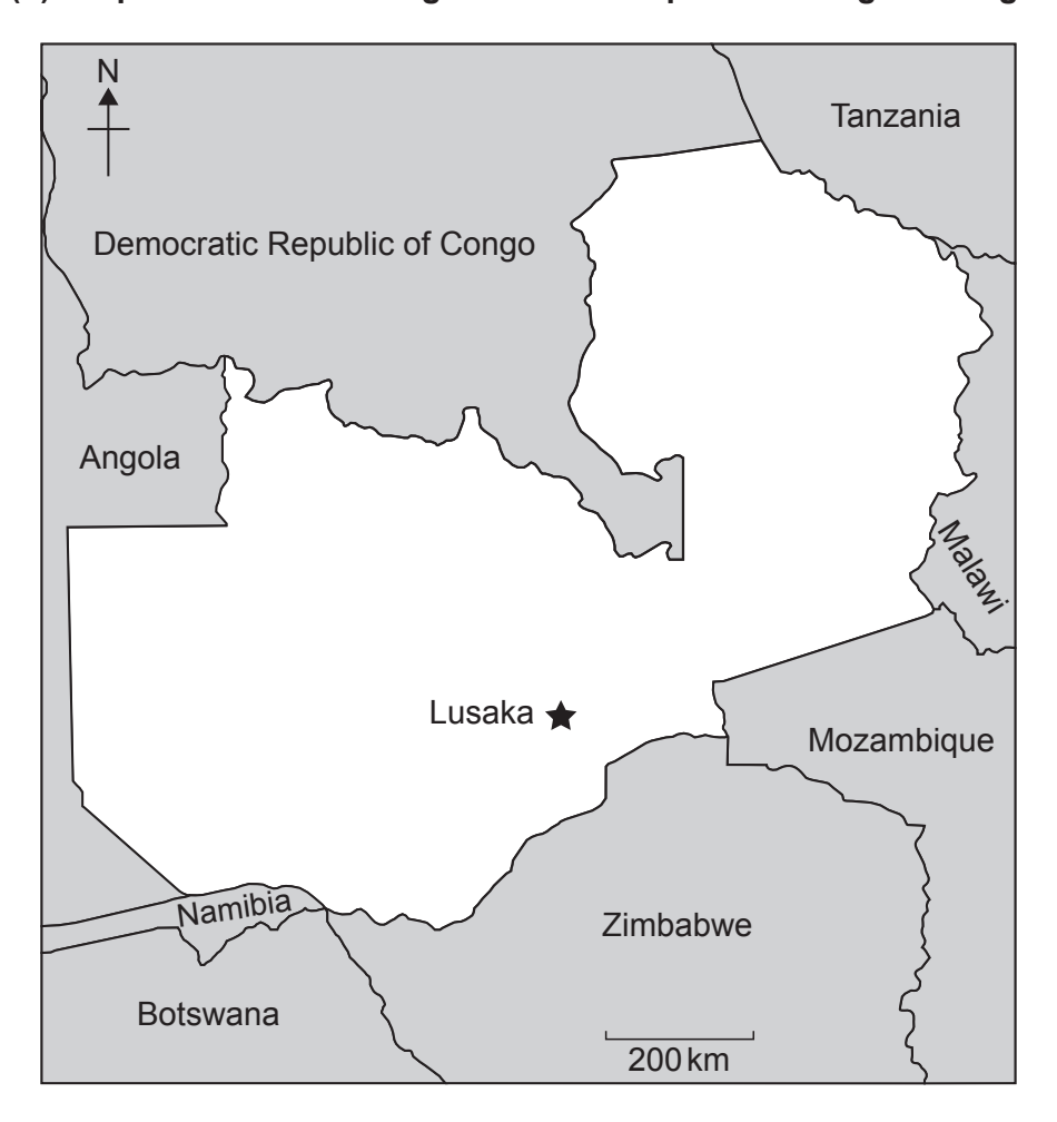
Figure 1(b): Map of Zambia showing Lusaka the capital and neighbouring countries